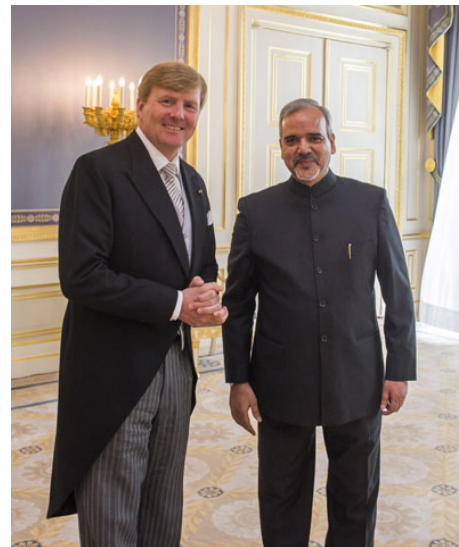
Credential ceremony at Noordeinde Palace