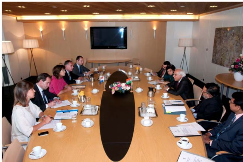
H.E. Mr. Kapil Sibal, Minister for Communications & Information Technology and Law & Justice in bilateral meeting with H.E. Ms. Lilianne Ploumen, Minister for Foreign Trade

Mr. Kapil Sibal, Minister for Communications & Information Technology and Law & Justice, Government of India visited the Netherlands from June 19-21. During his visit he met with Ms. Lilianne Ploumen, Minister of Foreign Trade and Development Cooperation; Mr. Fredrik Teeven, State Secretary for Security and Justice; Mr. Jozias van Aartsen, Mayor of the City of The Hague and Mr. Eberhard van der Laan, Mayor of the City of Amsterdam. During his meetings he exchanged views on issues of mutual interest to both the countries. He also had an interaction with senior representatives of prominent Dutch and Indian ICT companies in the Netherlands.