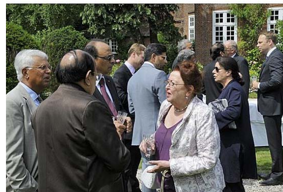
Vin d'honneur at India House following the presentation of credentials