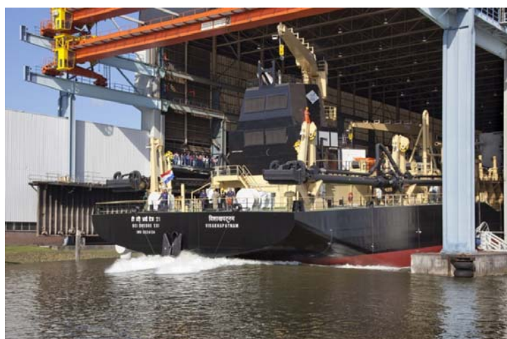
DCI DREDGE XXI floating out for the first time from the IHC Yard

The vessel will be deployed - along with the DCI DREDGE XIX and DCI DREDGE XX - for the maintenance-dredging project on the Hooghly River, which is a tributary of the Ganges River in West Bengal. These new DCI vessels are specially designed for this task, taking into account the Hooghly River's soil properties, strong current and shallow depth. The dredgers feature high levels of productivity, reliability and efficiency.