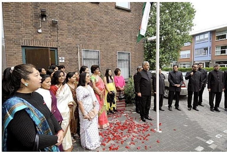
National Anthem being sung after the unfurling of the National Flag