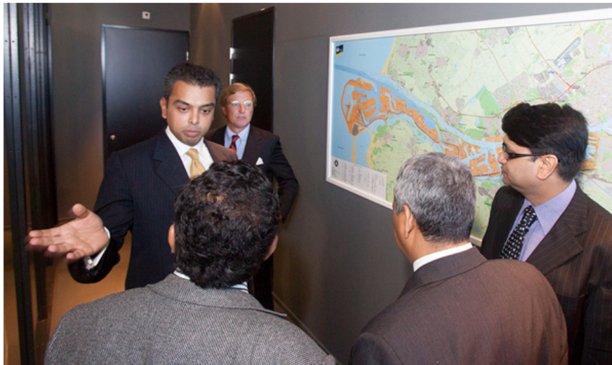
Minister Deora at the Rotterdam Port Authority

The Indian Minister of State for Shipping, Shri Milind Deora, led a 4-member delegation to The Netherlands from July 22-24, 2013. The delegation included Joint Secretary (Ports) and Advisor from Ministry of Shipping, CMD, Shipping Corporation of India Ltd., Mumbai, and PS to Minister. During the visit, the Indian delegation had discussions with officials at the Ministry of Infrastructure & Environment, Rotterdam Port Authority and APM Terminals. Bilateral cooperation in the field of shipping, especially in the area of inland shipping as well as infrastructure investment and development, were discussed during the visit.